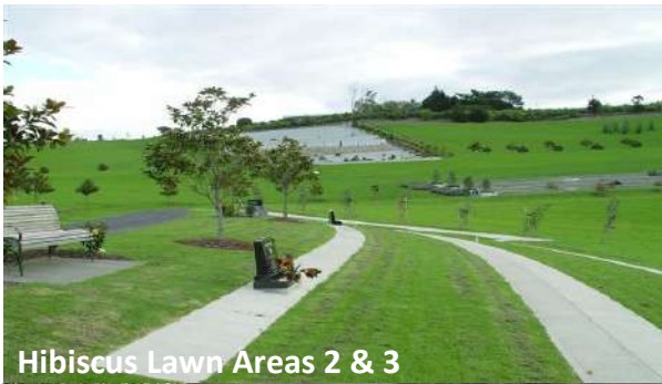
Hibiscus Lawn Areas 2 & 3