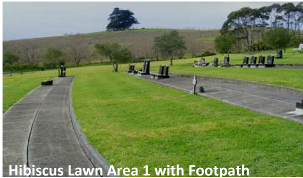
Hibiscus Lawn Area 1 with Footpath